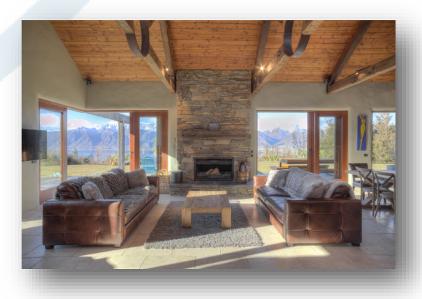
Kick back with a glass of your favourite wine and absorb the stunning views